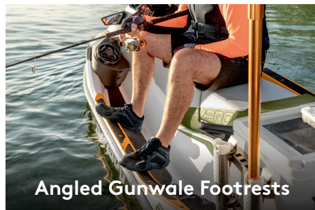
Angled Gunwale Footrests

Adds 11.5 inches to the back of the watercraft to increase stability, space, and storage capability.