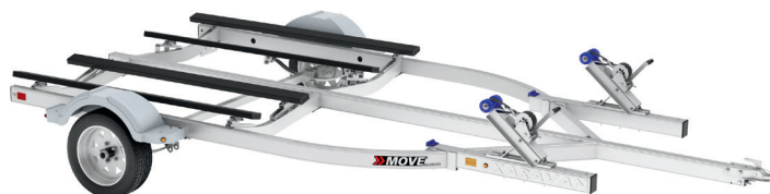
Aluminum MOVE II