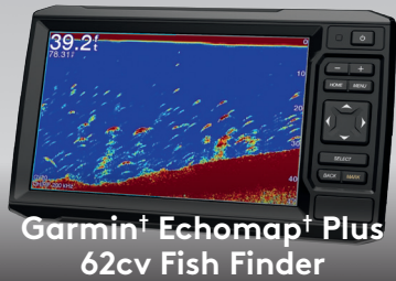
Garmin† Echomap† Plus 62cv Fish Finder

A top-of-the-line navigation, charting and fish-finding system using CHIRP technology for high definition images.