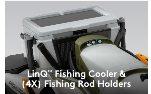
LinQ™ Fishing Cooler & (4X) Fishing Rod Holders

Optimized for ease of movement around the entire watercraft, and for better comfort and stability when facing sideways.