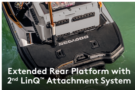
Extended Rear Platform with 2nd LinQ™ Attachment System

A spacious, quick-attach fishing cooler designed for easy access and equipped with numerous convenient features.